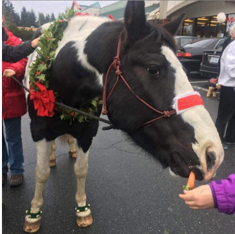
Holiday Horses Caroling through Bridle Trails Shopping Center and Neighborhoods