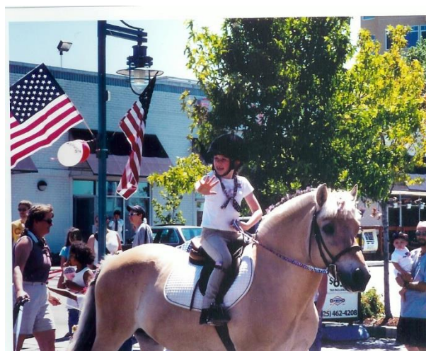
Kirkland 4th of July Parade

He gave those who needed it the confidence to ride again and he made me the rider and the person I am today. We had our struggles, we flipped over an oxer in the days before safety cups and both lost our confidence but there wasn't anything that would keep us down. The next year I am fairly sure I was high point champion on him. If I fell